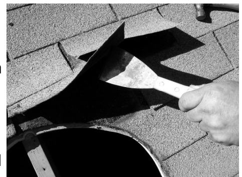
Fig. 3 - Lifting the Shingles

Step 7 - Lifting the Shingles: The shingles located directly above and to the sides of the attic hole must be lifted from the nails or staples holding them in place. This can be accomplished by inserting the reciprocating saw sideways, in between the shingles and the roof decking, at the 9 o'clock position of the attic hole. Then, in a sweeping motion cutting from the left-hand side of the hole to the right-hand side, use the saw to cut through the roofing nails until you reach the 3 o'clock position of the hole. Alternatively, any flat bladed tool (i.e. such as a trial) can be used to pry up the roofing nails as needed (see Fig. 3).