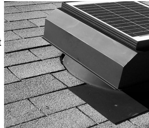
Fig. 5 - Installing the Attic Vent

Step 10 - Installing the Attic Vent: Using the roofing knife, cut a 4 inch gap in the shingles and tar paper at the 3 o'clock and 9 o'clock positions of the attic hole to allow the attic vent flashing to slide underneath. Position the attic vent unit so that it is horizontally centered with the attic hole. Slide the square flashing of the attic vent unit, underneath the shingles and tar paper, into the gap that was cut at the 3 o'clock and 9 o'clock positions of the hole. Lift the unit up at an angle while still in position. Note that the thermal switch (if included) should be hanging freely into the attic from the fan unit. Using the caulking gun, run a bead of caulk on the bottom side of the flashing facing the roof. When finished, continue sliding the unit upward and