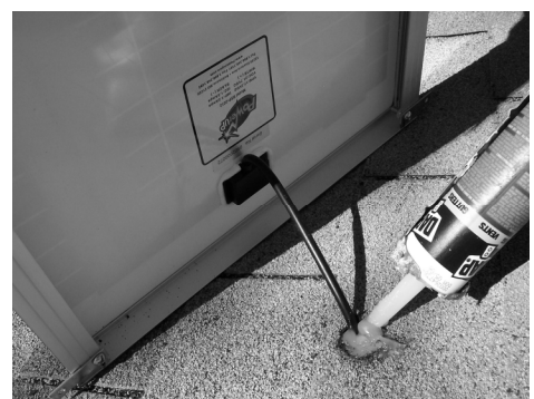
Fig. 4 - Mounting the Solar Panel

Step 8 - Mounting the Solar Panel: If installing Attic Breeze models AB-201A/202A/251A/252A, skip ahead to Step 10. Depending on the mounting bracket option you have chosen for your remotely mounted solar panel, you will need to either drill a hole in your roof or attic wall to accommodate the solar panel wire. Using a power drill equipped with a ½ inch bit, drill a hole in the roof centered over the area chosen for your solar panel or in the attic wall near your adjustable bracket. Insert the solar panel wiring through the hole and into the attic. Using the caulking gun, seal around the hole and wire (see Fig. 4). Install the solar